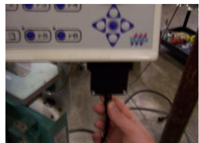
Image 2.B - Plug into Smart Connector