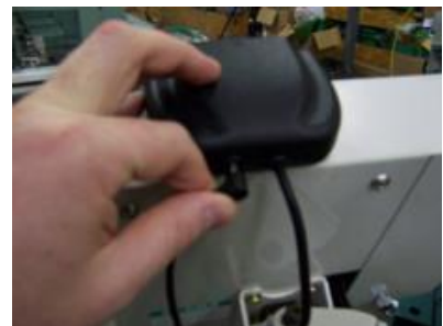
Image 2.C - Connect Power