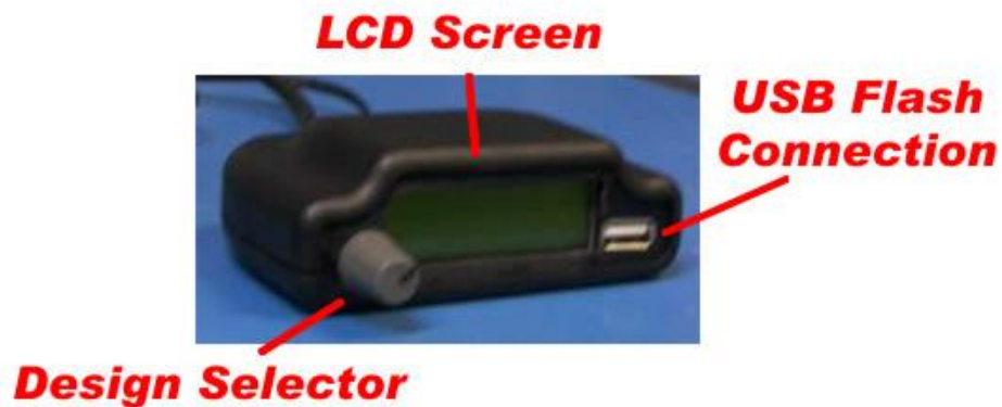
Image 1.A - Front of the USB Reader

Pictures and description of your device and its parts: