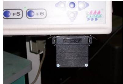
Image 2.A - Connect to Machine