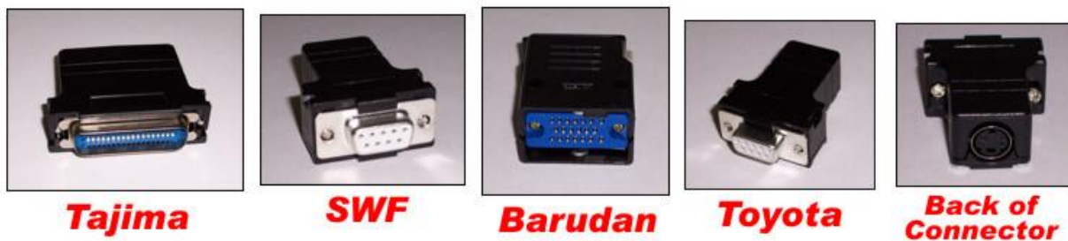
Image 1.C Smart Plugs